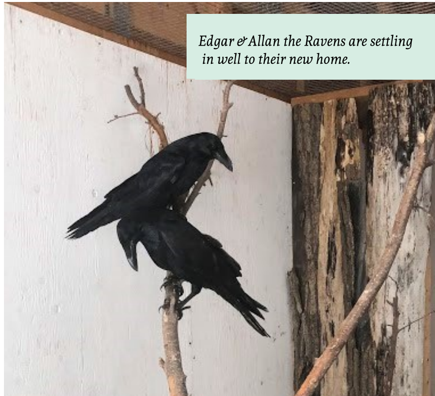
Edgar & Allan the Ravens are settling in well to their new home.

The pair are named for the famous poet and author of The Raven , Edgar Allan Poe, and affectionately known as the 'Poe Boys' by staff. Thank you to Grounded Coffee Company Inc. for your support in adopting Edgar & Allan.