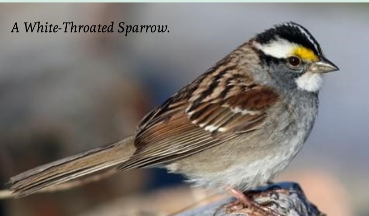
A White-Throated Sparrow.

You can learn more on Birds Canada's website, here.